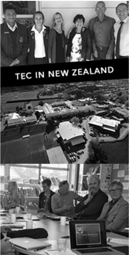
Go to Tina's Travel online gallery

That's all for now, read more at www.theexcellencecentre.org