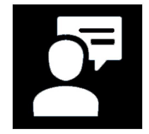
"As a newly established Christian School, TEC has played a very critical role in our journey. We