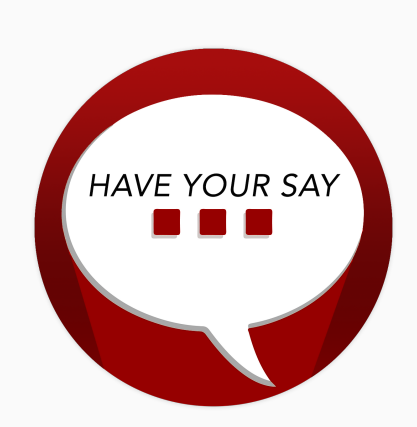
Join the TEC Connections List to receive these emails Subscribe here

We value your questions, thoughts and comments; so why not drop us a line to share how this newsletter has helped / inspired you. Send us an email