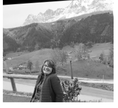
Go to Tina's Travel in online gallery